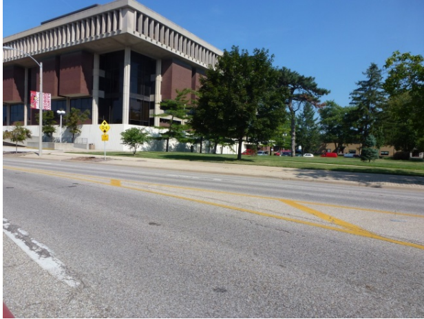
Original proposed location just West of College and School Streets. North side of College, west of School.