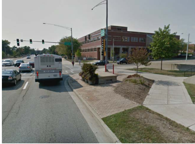
New proposed station just west of the original location on College St. and University Ave. North side of College, east of University