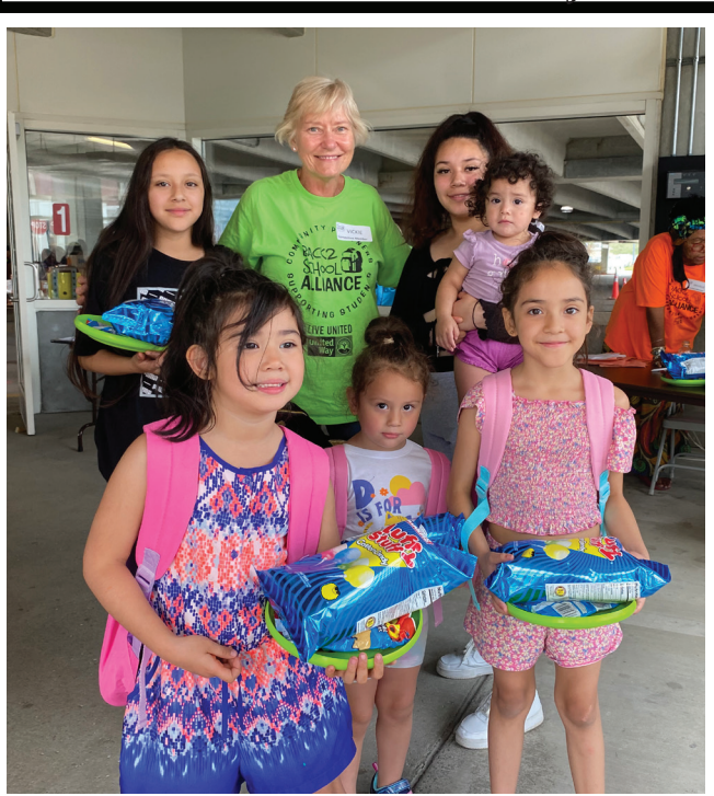
Back to School Alliance - August 11