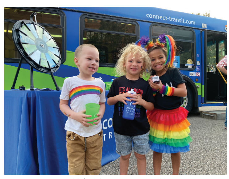
Pride Fest - August 13