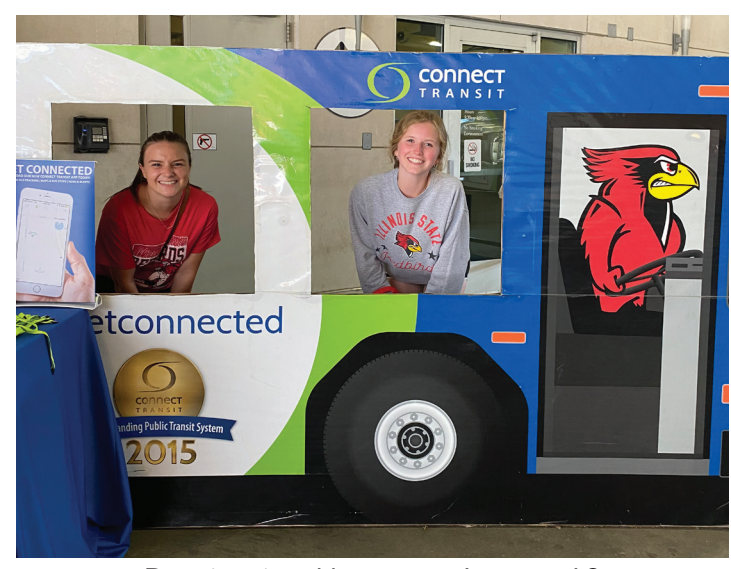
Destination Uptown - August 18